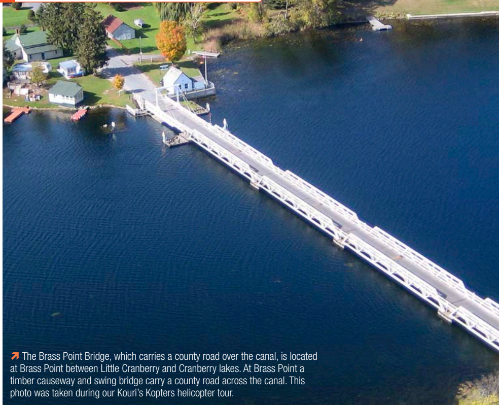
➤ The Brass Point Bridge, which carries a county road over the canal, is located at Brass Point between Little Cranberry and Cranberry lakes. At Brass Point a timber causeway and swing bridge carry a county road across the canal. This photo was taken during our Kouri's Kopters helicopter tour.