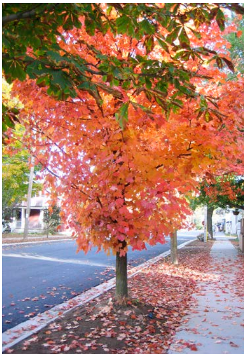
➤ Take the time to shop, explore and putter around this historic village. Tree lined streets with clapboard cottages are reminiscent of Nantucket.